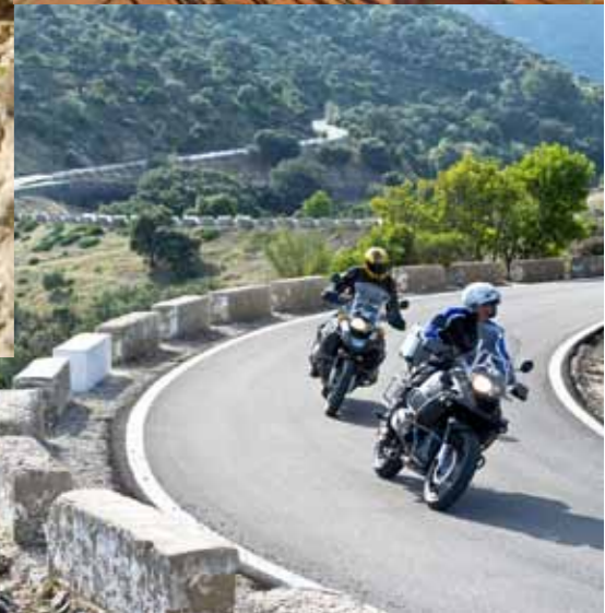
A quiet day on the A397 outside Ronda, one of Europe's best rides