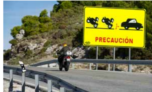
Don't make a mistake: vultures circle above the Ronda road