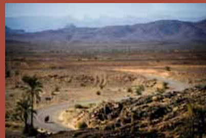
Morocco: another world but easy to reach